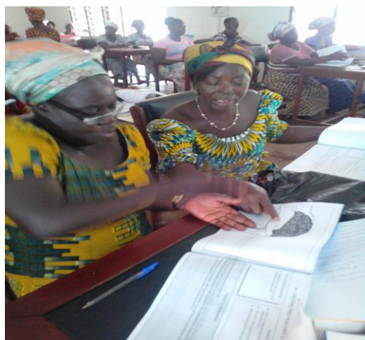
Section of the trainees at the training workshop

Organizational training Centre based at Akpafu Mempeasem. The participants were basically trained in basic midwifery practices, obstetric care, safe motherhood, HIV/AIDS, malaria and diarrhea.